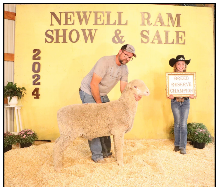
Reserve Champion Rambouillet Ram

https://www.dvauction.com/events/220158- newell-ram-79th-annual-9-20- 24/lots?page=1&items=50