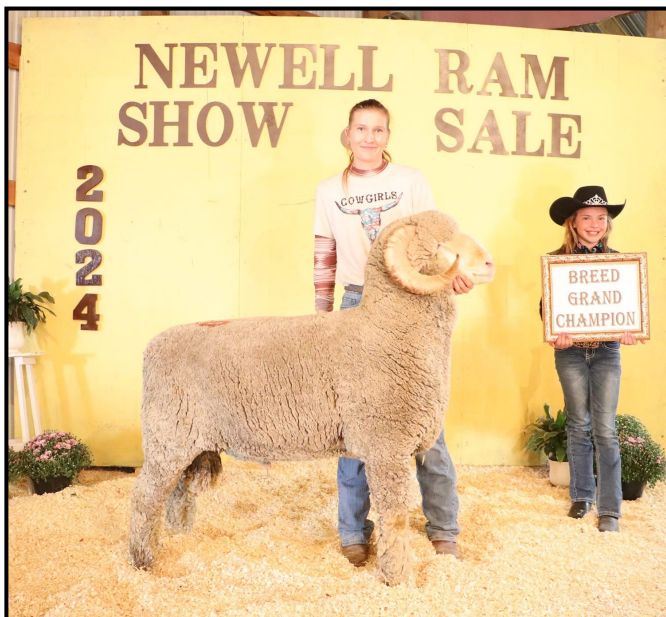
Champion Rambouillet Ram and Reserve Supreme Champion Ram