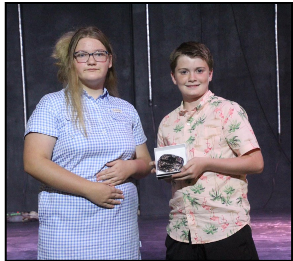
2024 Junior Showmanship Winner Sponsored by Dukart Family, ND