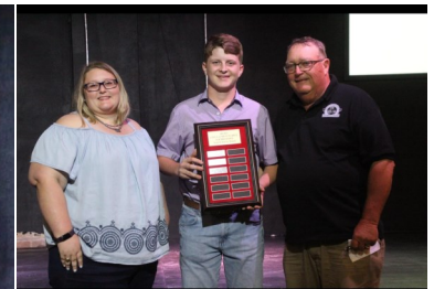
2023-24 Futurity Comeback Breeder of the Year & 2023-24 Futurity Yearlong Breeder of the Year