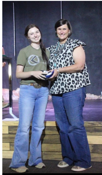
SENIOR WOOL JUDGING CONTEST WINNER