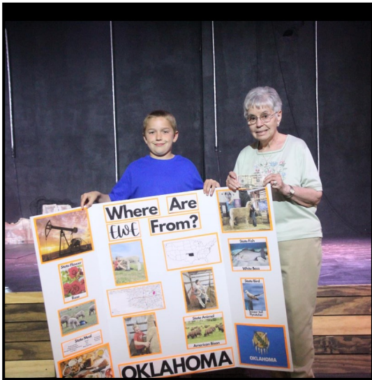
2024 Poster Contest Winner