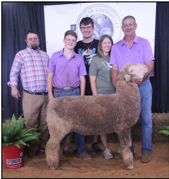
2024 NATIONAL CHAMPION RAMBOUILLET RAM