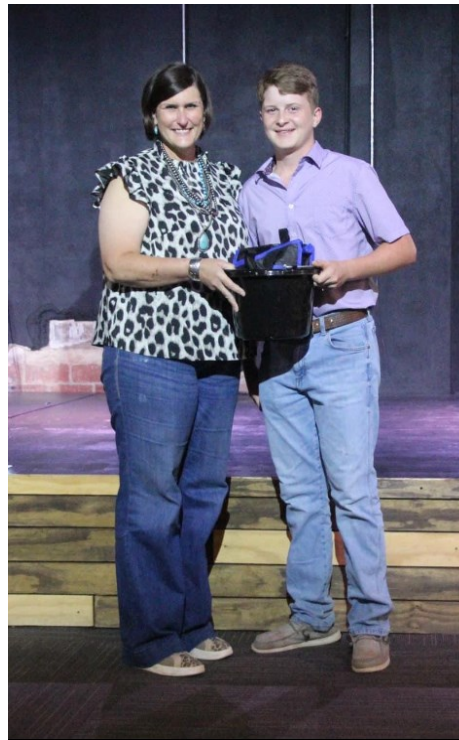
SENIOR WOOL JUDGING CONTEST WINNER