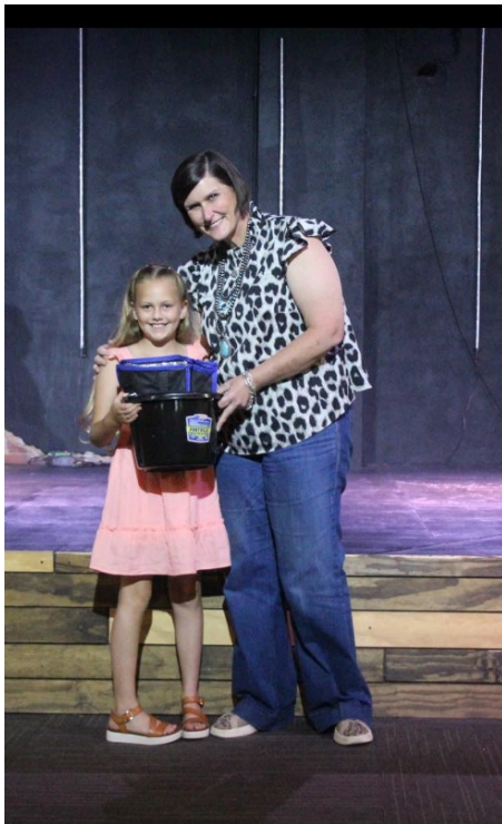
JUNIOR WOOL JUDGING CONTEST WINNER