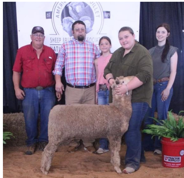
2024 NATIONAL CHAMPION RAMBOUILLET EWE