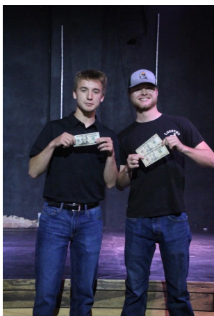
Junior Cornhole Winners

VISIT THE WEBSITE FOR A COMPLETE LIST OF SALE REPORTS AND WINNERS FOR THE 2024 ARSBA Online Sale 2024 ARSBA National Sale 2024 National Junior Show