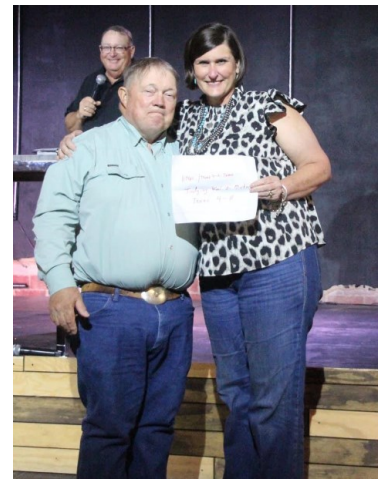
ADULT WOOL JUDGING BOOBY PRIZE WINNER