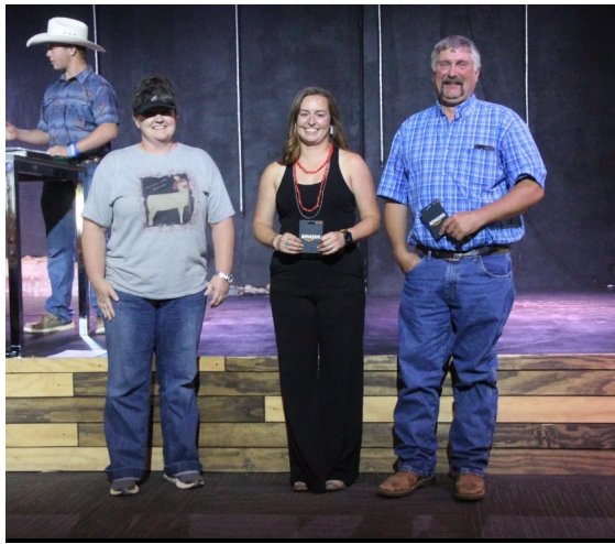
ADULT SKILLATHON WINNERS